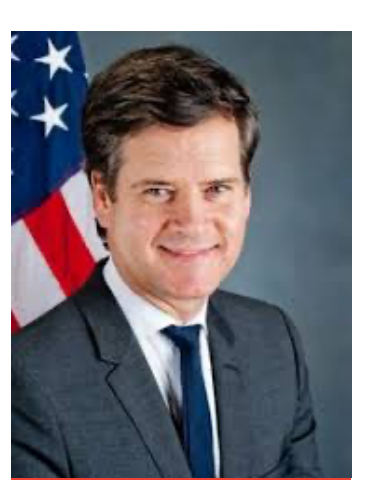
Brad Hoylman-Sigal* Senate District 47