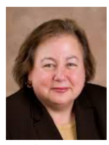
Liz Krueger Senate District 28