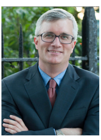
Brian Kavanagh Senate District 27